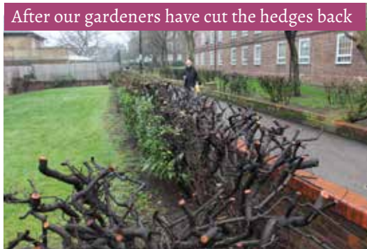
After our gardeners have cut the hedges back