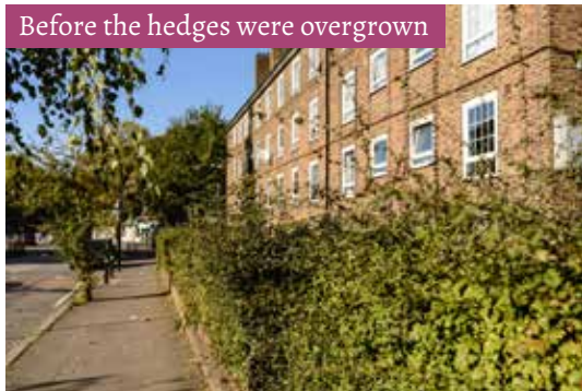
Before the hedges were overgrown

Our gardeners, caretakers, bulk waste and estate sweeping teams are working closely together to make sure your green spaces and outside areas look great.